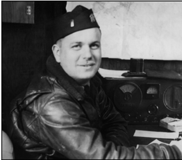
NAS Kodiak, Alaska, October 17, 1943. Duty Officer, VS-70